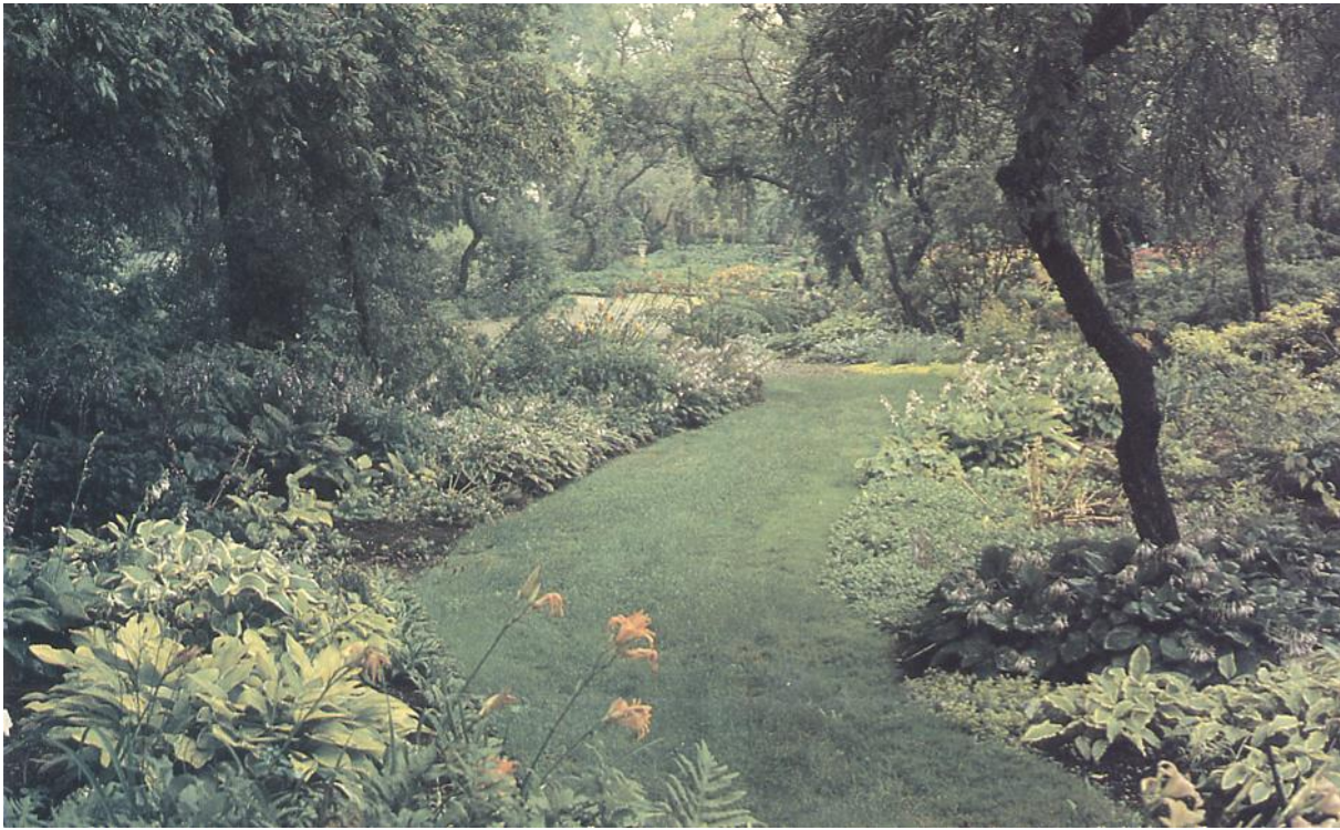
True gardens invite repose.

as architectural components — green lumps of specific sizes and shapes that remain the same all season and require little, if any, care. In a garden, the primary emphasis is upon each plant as such — upon what a plant does and how it changes from season to season, day to day and hour to hour.